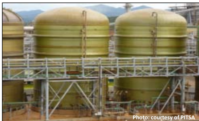
Figure 3 Large-diameter Advantex® Glass FRP tanks used for storing hydrochloric acid provides superior corrosion resistance

Despite the corrosion industry’s propensity for using high-cost metal alloys with various coating technologies to extend the life of metallic structures in highly corrosive environments, Advantex® glass reinforced FRP materials serve as a higher performing alternative to expensive metal alloys. These Advantex® glass FRP materials provide lightweight (seven times lighter than CS), superior corrosion performance (of years to days/weeks with E-Glass-FRP/metals), and design flexibility for producing both large- and small- scale structures (figure 3). And, unlike structures made with metal alloys, those made with FRP materials with Advantex® glass do not require coating or painting resulting in savings in the overall project cost (direct and indirect costs).